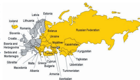
■ EMC Data Coverage on Database (over 7,7 Million records)

Albania, Armenia, Azerbaijan, Belarus, Bosnia, Bulgaria, Croatia, Cyprus, Estonia, Georgia, Gibraltar, Greece, Kazakhstan, Kosovo, Kirghizia, Latvia, Lithuania, Macedonia, Malta, Moldova, Montenegro, Romania, Russian Federation, Serbia, Slovenia, Tajikistan, Turkey, Turkish Cyprus, Turkmenistan, Ukraine and Uzbekistan